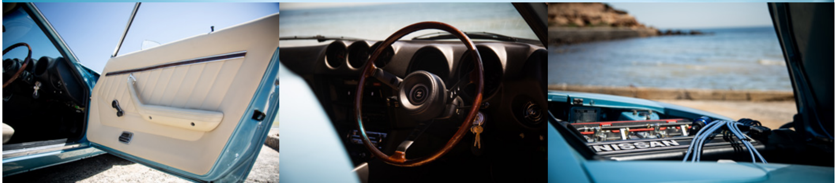
CLOCKWISE FROM TOP: 1. The original seats include 'fairlady Z' embroidery and sporty eyelets, taking inspiration from earlier 240Z models. 2. A good way to spend 30 grand is on a brand new engine for your 260Z. 3. Great move to add in the Timber steering wheel and gear knob. 4. A door to a better life...

" Things like the eyelets on the seats, whilst they weren't on the later 260 seats, they worked really, really well sitting in these